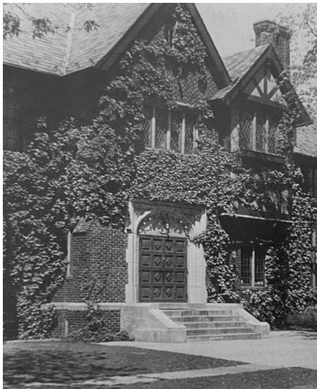
The Community House Circa 1960