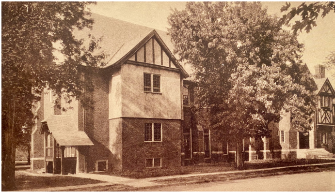
The Community House Circa 1940