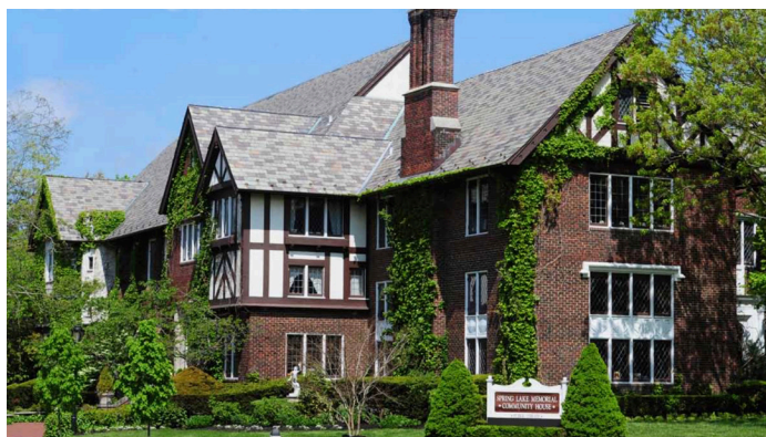
The Community House Today