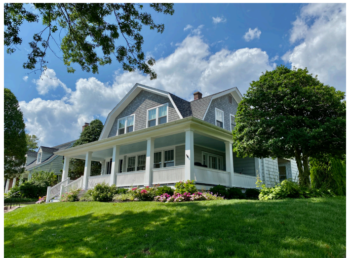
Two of this year's House Tour Homes